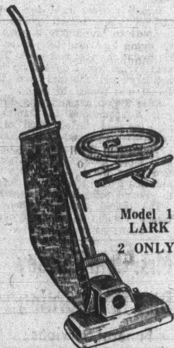
Model 14 LARK 2 ONLY