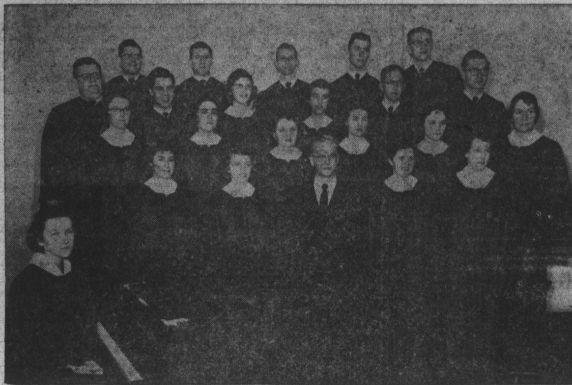
The Marion College choir, composed of 22 singers and its director, will present a program of sacred music at the Pleasant Valley Wesleyan Methodist church, two miles east and one mile south of Monroe, Monday evening at 7:30 o'clock.