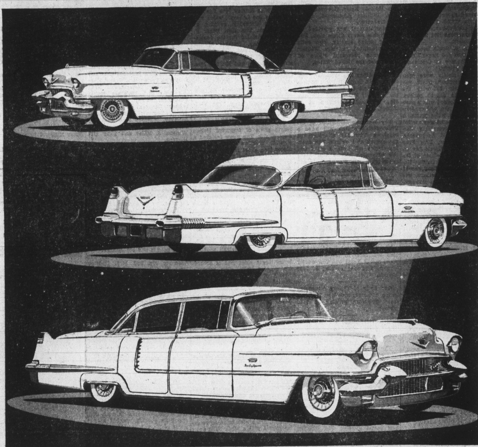
Top to bottom—Eldorado Seville, Sedan de Ville, Sixty Special

Presenting the Most Inspiring Motor Cars the World Has Ever Seen!