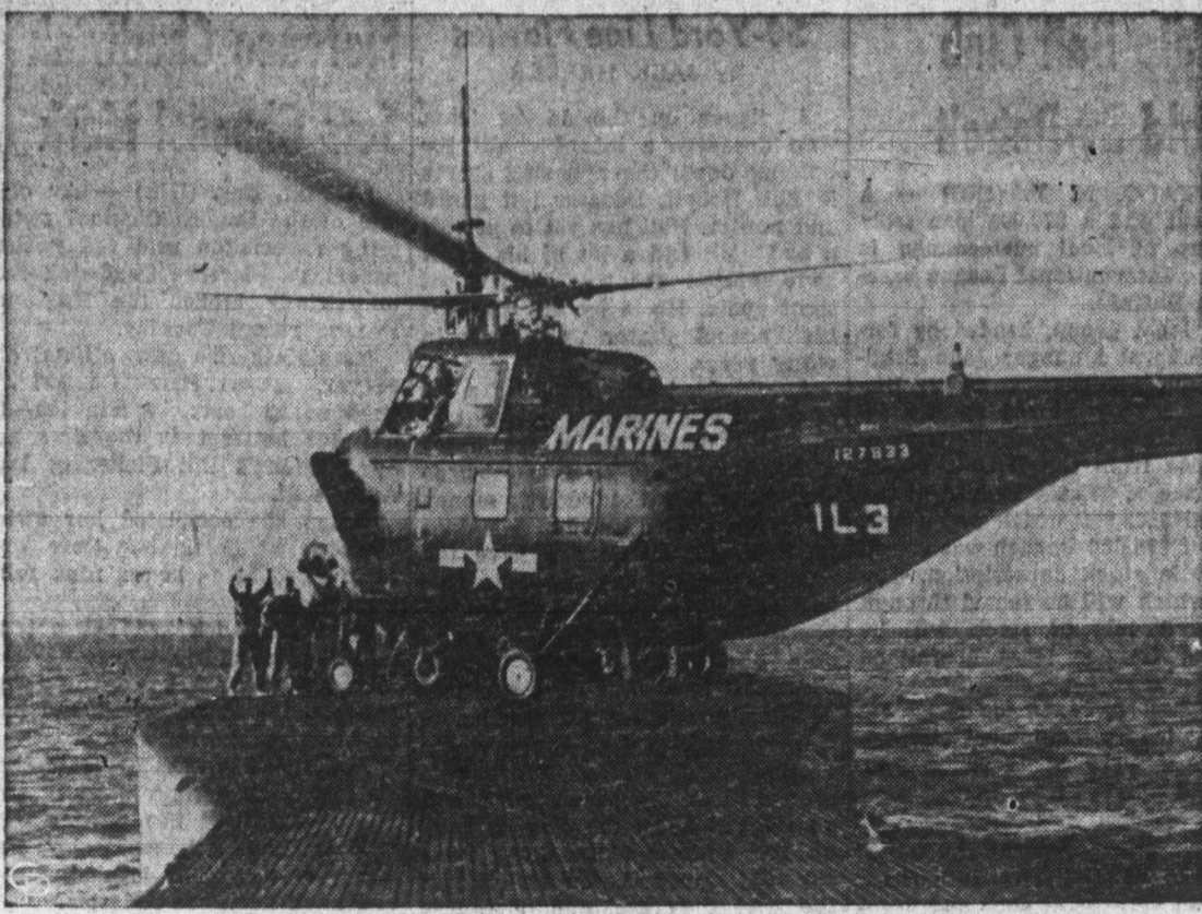
THIS UNUSUAL SCENE shows one of the few times an aircraft of any kind has landed on a submarine. It's a 'copter on sub Sea Lion during maneuvers off Carolina.

A spokesman at Lambeth Palace, the archbishop of Canterbury's London residence, said the royal visit had nothing to do with Margaret and Townsend. The family will be attending the rededication