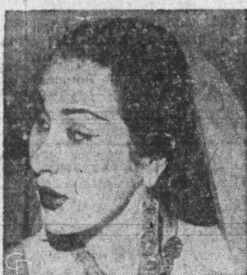
SINGER YMA SUMAC said she would stand squarely by...