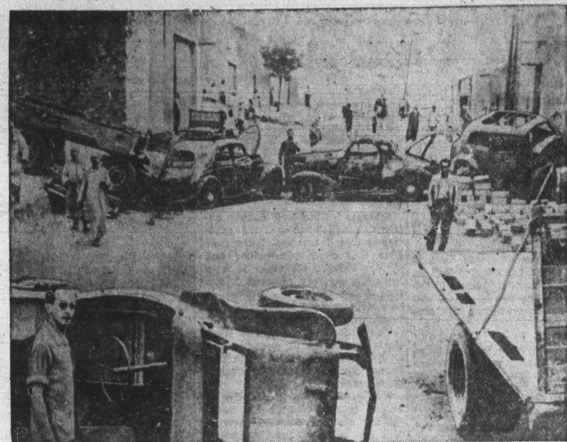
Wrecked autos form barricade in Khenifra. Arabs set up the barricade against the French.

DON'T TAKE A CHANCE TAKE PLENAMINS Smith Drug Co.