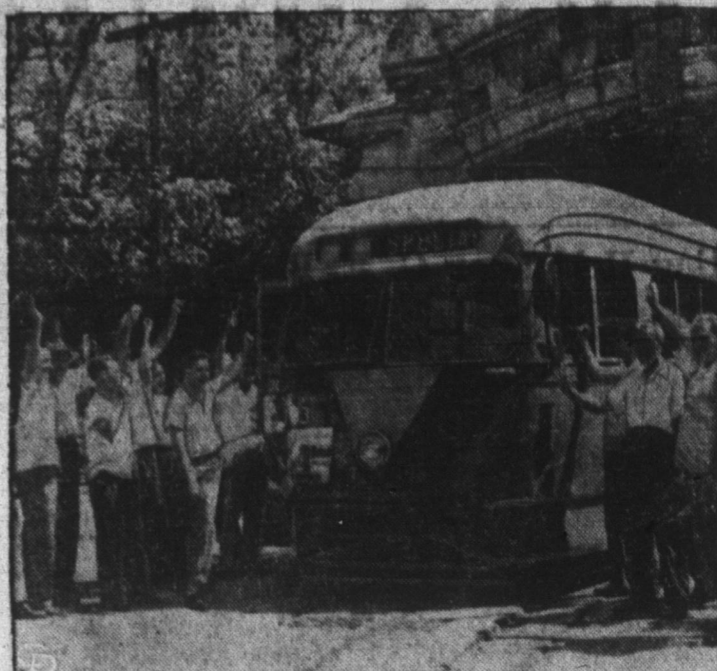
WASHINGTON TRANSIT workers wave as test vehicle leaves car barn at end of the 52-day strike. The strikers won a pay increase, and fares were upped.

WASHINGTON (INS) Farmers are reported to be raising slightly more than 63 million turkeys this year, four per cent less than last year according to preliminary Agriculture Department estimates.