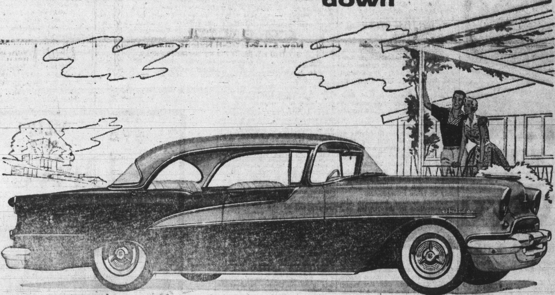
Super "88" Holiday Sedan—hardtop with 4 doors!