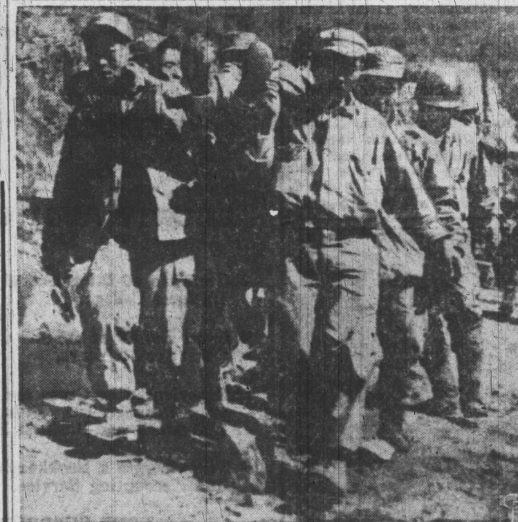
BATTLE FOR TRIANGLE HILL is over for this 7th division soldier, shown being carried down the steep slope by South Korean litter bearers.