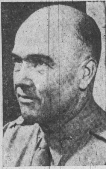
A HIGH LEVEL board set up by UN Supreme Commander Gen. Mark Clark in Tokyo to investigate the Koje Island POW kidnap-ransom case is headed by Maj. Gen. Blackshear M. Bryan (above). The U. S. 8th Army has turned over findings of its own investigation to General Clark.

Lowell, Ind., May 22 — (UP) — Thirty cars of a 69-car Monon freight were derailed today and alcohol in six tank cars burst into flame, threatening the business section. Burning alcohol flowed down the streets and into gutters before volunteers brought the blaze under control with foamite and water some four hours after the derailment. The Lowell depot was "smashed into kindling" by three freight cars, but most of the fire was confined to an area at the crossing of Indiana highway 2. Freight cars piled up four deep in the center of town, blocking highway traffic for miles, state police said. Intense heat, which kept firemen 100 feet away, hampered efforts to bring the blaze under control, according to Harold Heuson, 43-year-old volunteer fireman from Lowell. "We thought the whole town was going up," Heuson said. "but the boys really pitched into it." If the tank cars had gone 100 feet farther, though, there wouldn't have been much we could have done to save the business section," he said. Fire fighters feared the alcohol would "let go" after several small explosions rocked the wreckage. But seven pump trucks spraying water and one foamite unit prevented a large blast. Officials reported there were no injuries although several persons had been in the depot a short time before the crash. Engineer Claude Smith of Lafayette, Ind., said the derailment probably was caused by a locked wheel.