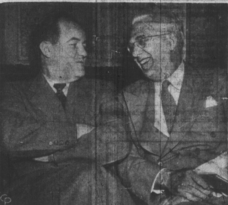
SENATOR HOMER FERGUSON (right), (R), Michigan, whose amendment to withhold any new government funds for operation of the government-seized steel industry passed the Senate by a 44-31 vote, sits with Senator Hubert Humphrey (D), Minnesota, who led the administration opposition to the amendment.

Detroiters make most of the Nation's motor cars, and drive more of them in proportion to population than any other major city except one—Los Angeles.