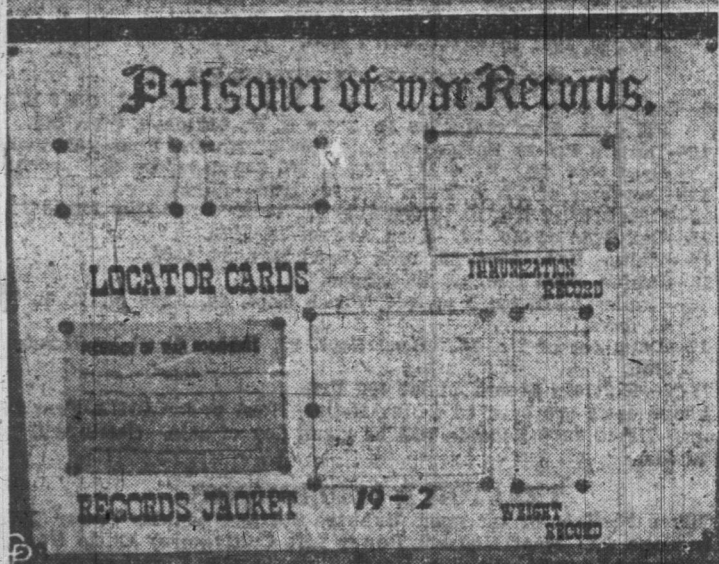
Inmate sentenced to the treatment given Allied prisoners in North Korean camps is the scene (top) taken at the U.N. camp for Communist POWs on Kojido Island. There a group of captured Chinese Reds go through their morning exercises. At bottom is a close-up of a typical health record kept of each prisoner. All sicknesses are detailed, and other general information recorded.