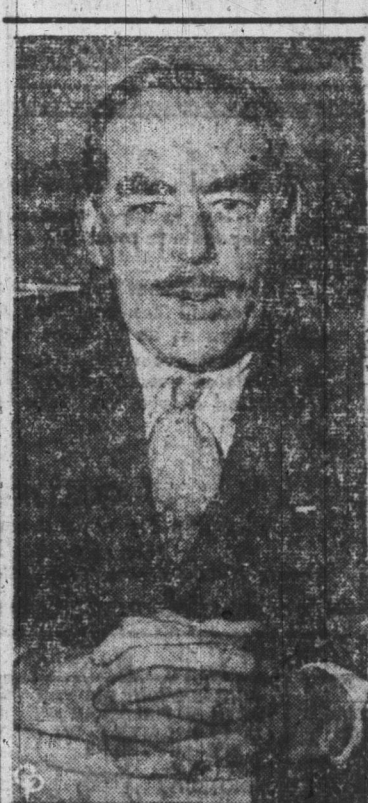
STATE SECRETARY Dean Acheson announces in Washington that the United States placed a ban on private travel to Hungary by Americans and once again closed the Hungarian Consulates in New York and Cleveland. This action was taken in reprisal for the imprisonment of four U.S. airmen freed by payment of $125,000 "ransom."

Go to the church or your choice next Sunday.