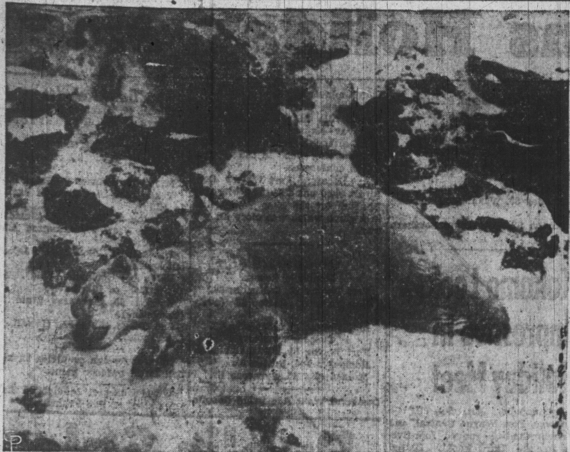
YOU MAY NOT LIKE the current weather in northern United States, but Mr. Polar Bear is right in his element in the Pittsburgh, Pa., zoo. For him it's a matter of the best way being over.