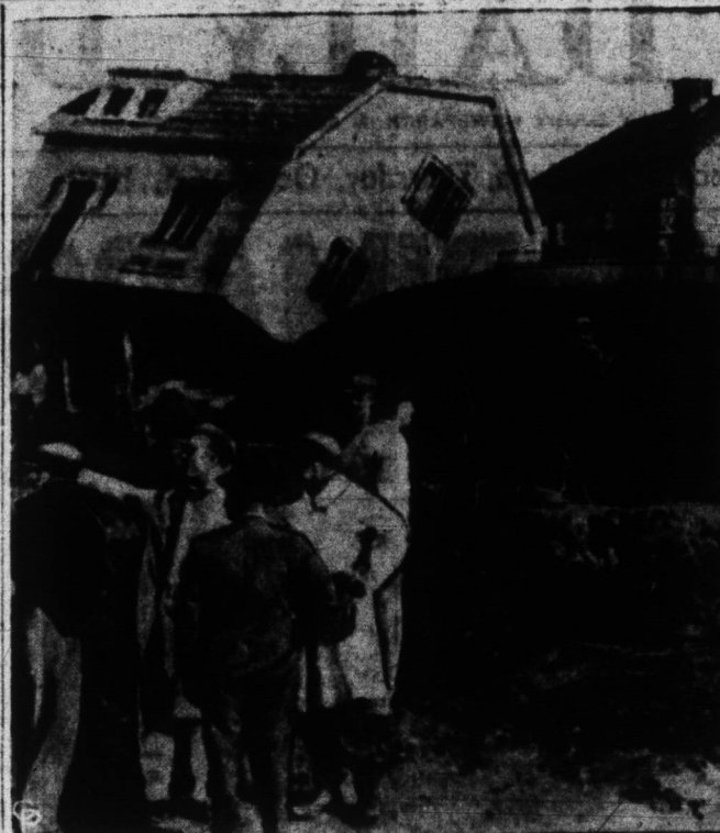
SCORES OF HOUSES tilting at crazy angles leave the village of Surle, Sweden, a bitter reminder of the landslide which swept most of this 2,000-population town into the Costa River. Casualties include one known dead, 100 missing and 20 injured.