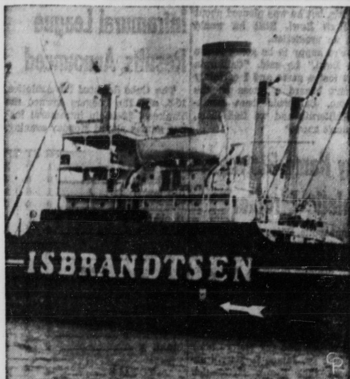
WITH A PATCH (arrow) over the hole ripped in her side by shell from Chinese Nationalist gunboat, the Isbrandtsen Line freighter "Flying Cloud" rides in Korean waters. Gunboat apparently fired one warning shot across bow before shelling.

Costs little. New introductory use now only 50c. At all drug stores everywhere. In Decatur at Smith Drug Store.