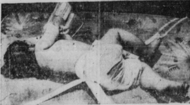
Baby can roll sideways and have his bottle all by himself.