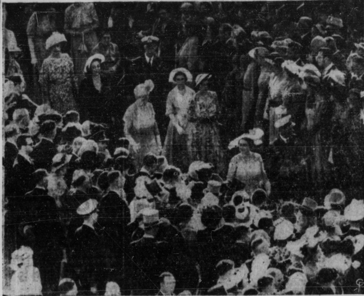
MEMBERS OF BRITAIN'S RULING FAMILY ARE SHOWN PASSING through a receiving line of guests at a royal garden party in Buckingham Palace. Leading the way are King George and Queen Elizabeth. They are followed by Princesses Elizabeth and Margaret Rose, Dowager Queen Mary and Prince Philip.