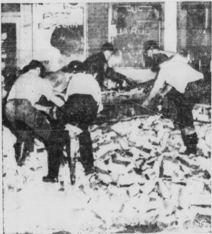
FOUR PASSERSBY KILLED and nine injured is toll of this wreckage, collapse of a building parapet in Pittsburgh, Pa. Firemen dig through rubble for bodies of victims. (International Soundphoto)