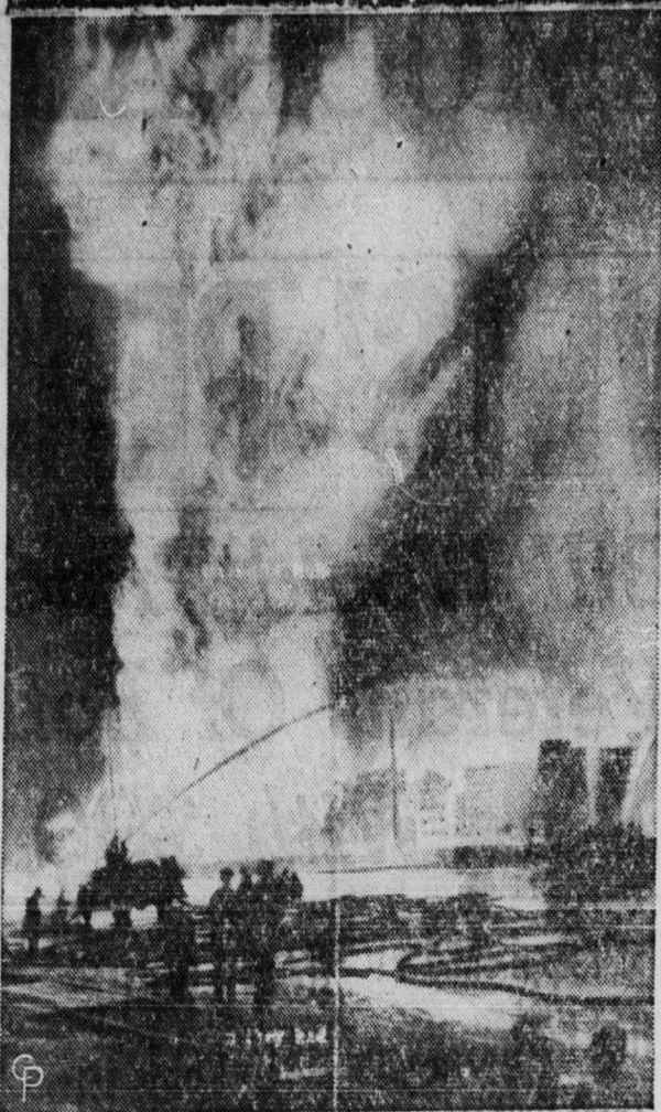
FLAMES AND SMOKE shoot hundreds of feet into the air at Oakland, Cal., Army base's pier 4 as warehouses storing oil and supplies for overseas troops are destroyed with loss estimated at $1,000,000. The six-alarm fire spread so fast two transports caught fire and had to be towed to safety.