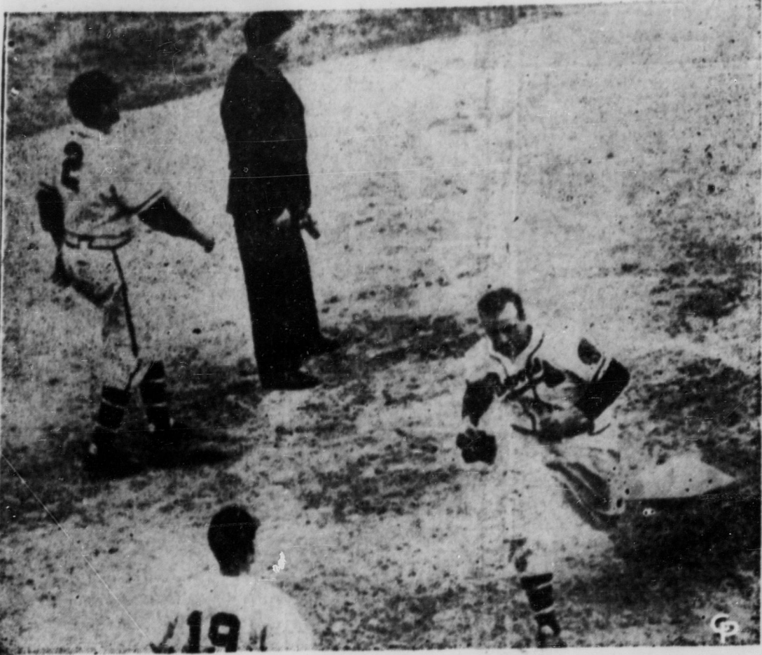
PHIL MASI, Boston Braves catcher, cap in hand as befits a Back Bay gentleman, crosses the plate with the only run of the first game of the 1945 world series. Masi scored on a hit by Holmes in the eighth inning. The Braves conquered Cleveland's ace, Bob Feller, nullifying his 2-hit pitching, to win 1 to 0.