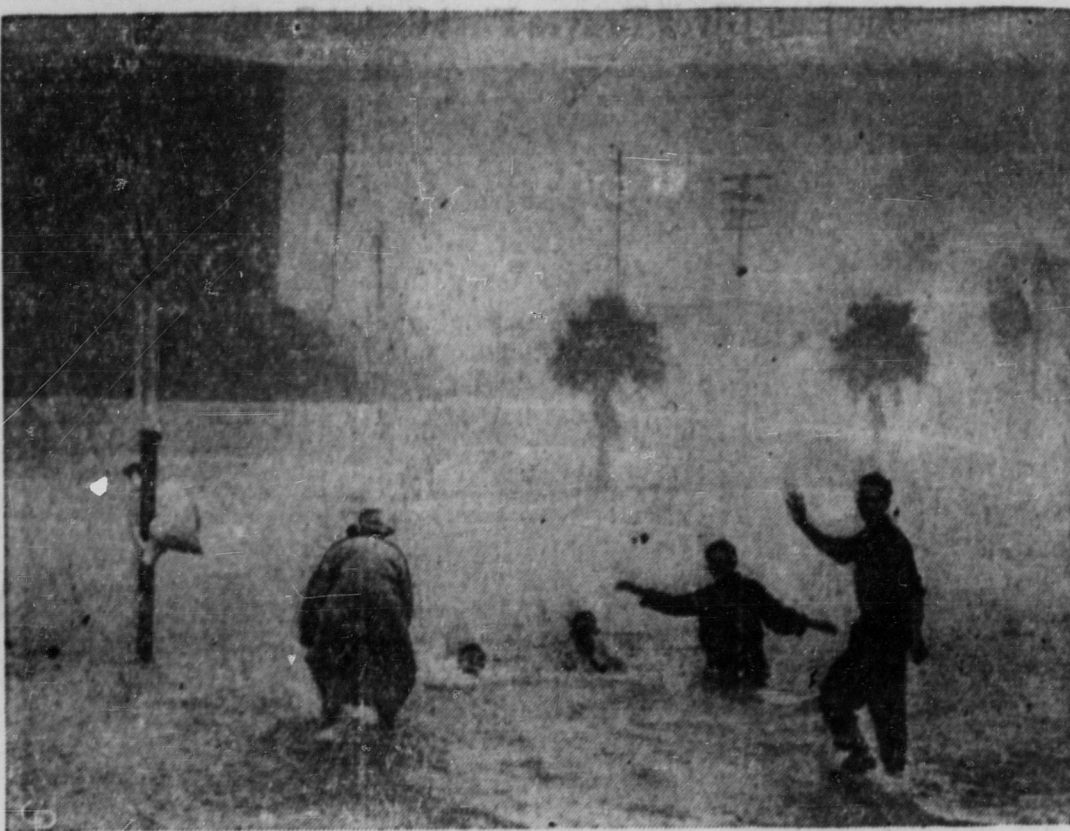
HIGH WATERS that flooded Miami in the wake of another Florida hurricane provide a group of youths with an opportunity to play in the submerged driveway of a filling station. Aside from the floods which drove 200 persons from their homes, damage was comparatively light in Miami, although it totaled $12,000,000 in Cuba and other sections of Florida.

day night. Today the Brown Swiss and Holstein cattle will be judged and Friday the Guernseys, Jerseys and Ayrshires. The hog show is being held today and a hog sale will be at 6 p. m. Friday. Tonight