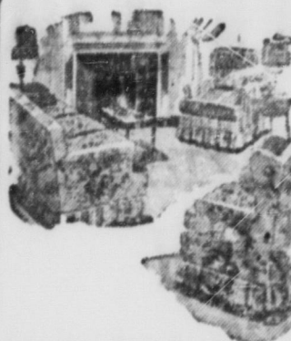
Living Room Suites