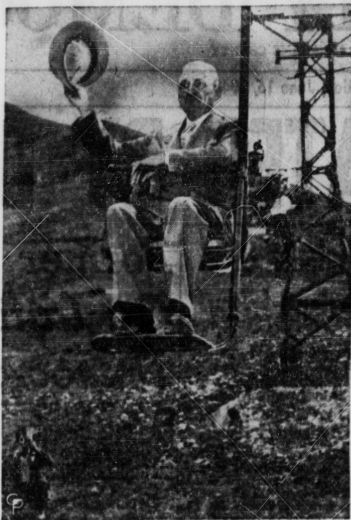
TIME OFF FROM POLITICS is taken by President Truman while at Sun Valley, Id., to try the ski lift up Dollar mountain before continuing his transcontinental campaign trip.

Monroe, Ind. We Deliver Open each night till 9 P. M. Except Wednesday