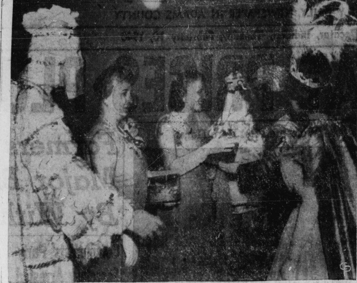
MRS. HARRY TRUMAN (left) and her daughter, Margaret, are greeted by the Moslem carnival king's "royal court" at New Orleans ball, an event of the annual Mardi Gras festivities.

ing bills—to remove most of the furniture and clothing from the burning structure before the roaring flames reached them. The number who participated in the hasty removal of the buildings contents could not be accurately estimated, but at one time it was believed there were at least two dozen men running a "human chain" to the second story apartment on the north side of the building. It was due to the efforts of all these volunteers that the fire loss was confined mainly to the building itself.