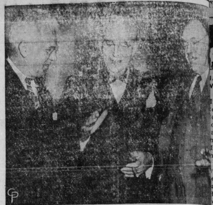
SENATE GOP POLICY COMMITTEE, including (from left) Senator Homer Ferguson (R), Mich., President Pro Tempore Arthur H. Vandenberg (R), Mich., and Chairman Robert A. Taft (R), Ohio, at the 80th Congress reconvening in Washington.

An army of more than 800,000 municipal fire fighters is maintained throughout the United States on a full-paid, 24-hour basis.