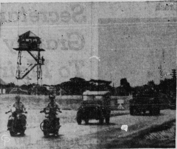
First convoy of trucks and personnel withdraw.

IN ACCORDANCE with rejection by the Panamanian National assembly of an agreement calling for five-year leases on 13 sites for defense of the Panama canal and 10-year lease on B-29 air base at Rio Hato, C. Z., U. S. forces withdraw in an evacuation that will empty all but two of the bases by Jan. 14. (International)