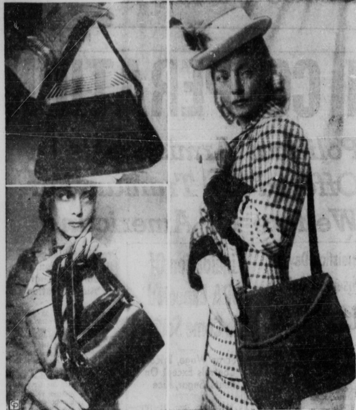
Top left, dressy afternoon handbag; below, barrel shaped daytime bag; right, over-the-shoulder bag.