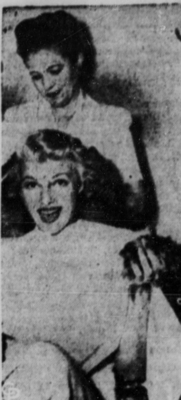
RITA HAYWORTH'S gorgeous long red tresses get the scissors treatment as the lovely movie star prepares for a new film. As if donning a "cinema swirl bob" wasn't enough, the redhead is changing to topaz blonde.

Both the AFL and CIO unions had insisted at the beginning of negotiations that the U. S. maritime commission apply to government controlled ships in the Pacific the terms of any agreement reached with Gulf and Atlantic operators. West coast negotiations have been deadlocked almost since the outset over union security demands.