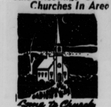
Come to Church

First Presbyterian Effective for one week only, the adult choir practice of the First Presbyterian church will be held Tuesday evening at 8 o'clock instead of the usual Thursday evening rehearsal. The change was necessitated because of the enforced absence of the pastor Thursday evening.