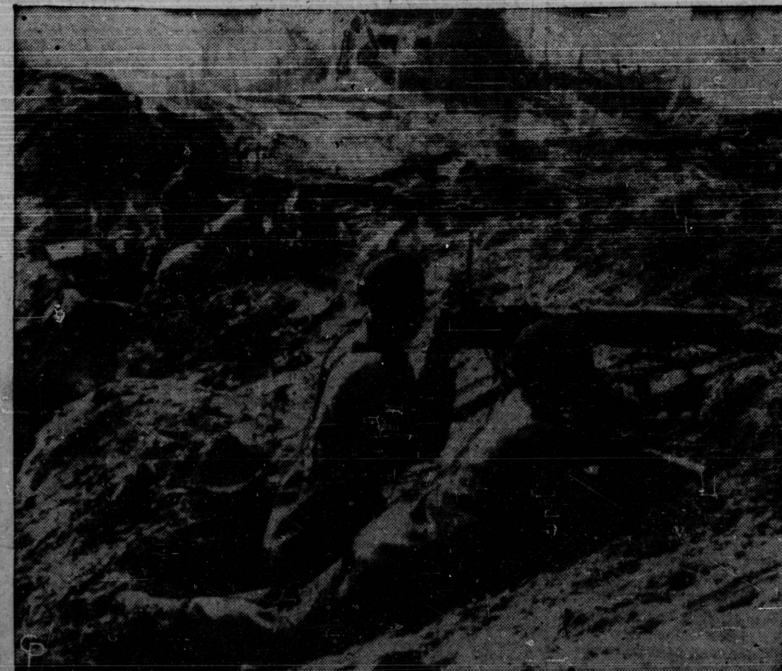
FOUR HOURS AFTER THEY CROSSED the River Rhine, these British Commandos, carrying Vickers machine guns, aim their weapons on Wesel, from the outskirts of the German industrial city. This is an official radiophoto.