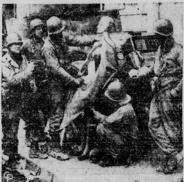
OUR YANKS ARE NEVER DULL boys, as is evidenced in the above photo, which shows them taking time out for a bit of that "play" that keeps "Jack" bright. They battled their way into Trier, Germany, with units of the U. S. Third Army, and seeking diversion, have picked up a clothing store dummy for a "swastika draping" fashion show.

Processed Foods Blue stamps X5 through Z5 and A2 and B2 valid through March 31. Blue stamps C2 through G2 valid through April 28. Blue stamps H2 through M2 valid through June 1. Blue stamps N2 through S2 valid through June 30.