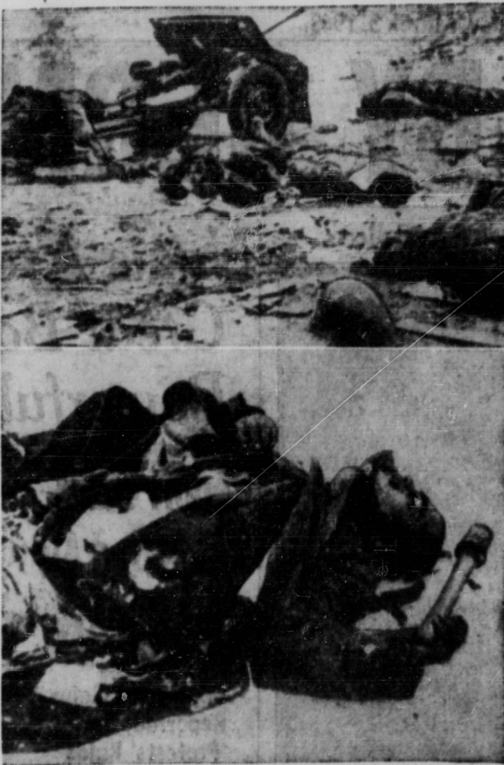
ON THE STALINGRAD FRONT this is a common scene. The advancing Red Army, which entered the shattered city weeks ago, dropped a shell into a pocket where a Nazi gun crew was blazing away. The result is pictured. In lower photo, the Nazi never did get to throw the grenade. It is frozen in his hand.