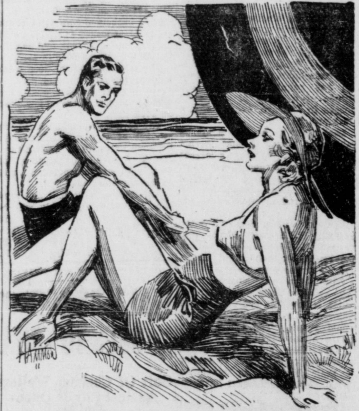
Lucy Lee had never before known anyone like Neville Preston.

want to buy Bloom-of-Youth Cosmetics. It was all very exciting and confusing. She would have liked to write Clyde about it but there simply wasn't time. "Three hundred dollars a week! And if it hadn't been for me, it would never have happened." Pearl's voice rose shrilly, as it always did when she got excited. "Hollywood! Just think of it. We're going to Hollywood. Well, I always did believe if you kept your mind on things long enough and hard enough you were bound to get it.