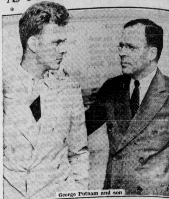
George Putnam and son