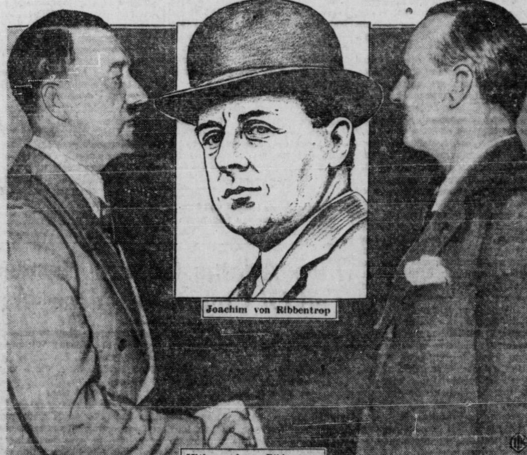
Joachim von Ribbentrop

Prospects of a new era of friendly feeling between Germany and England are seen in the appointment of Joachim von Ribbentrop as ambassador to the Court of St. James. One of the most astute and capable diplomats in Europe, this former champagne salesman has established himself in British favor and should do much toward improving relations of the two nations. Von Ribbentrop served in the German army throughout the war, returned to private life as a champagne salesman after the armistice, and became associated with Hitler in 1928. He has accomplished several important missions for the Nazi regime and is looked on as the reichsfuehrer's most trusted emissary.