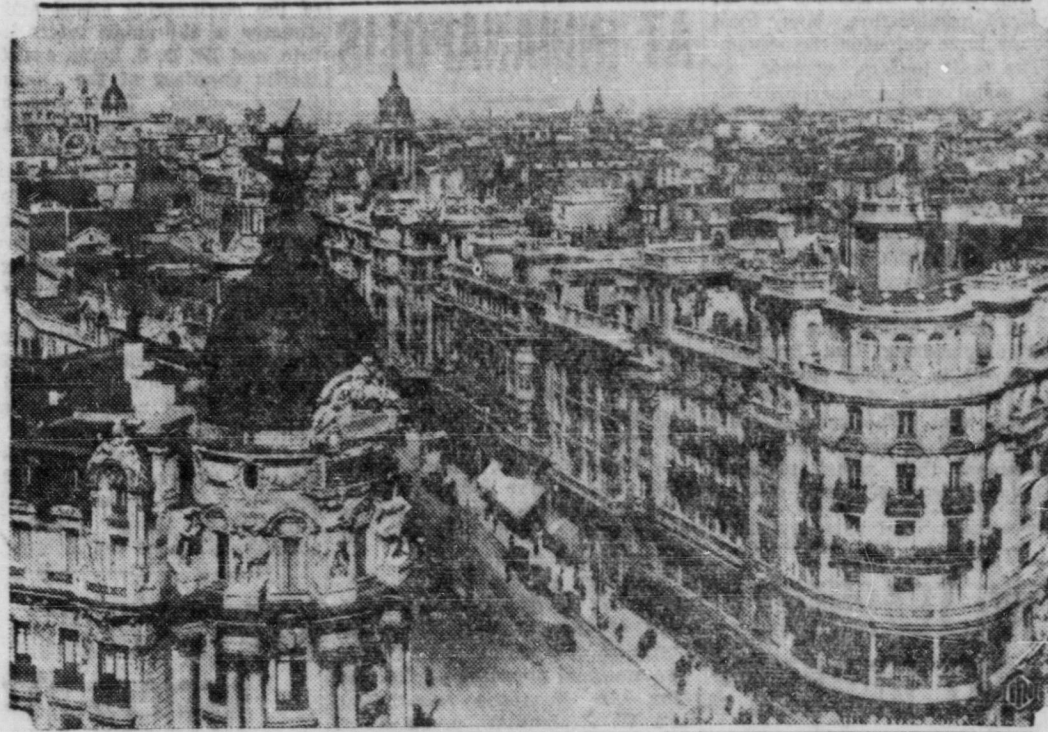
Modern section of capital

Sweeping all resistance before them in an avalanche of steel, insurgent forces drove into the Spanish capital after a series of air raids which killed scores and took a terrific toll of damage in the modern business and residential section of Madrid, shown above.