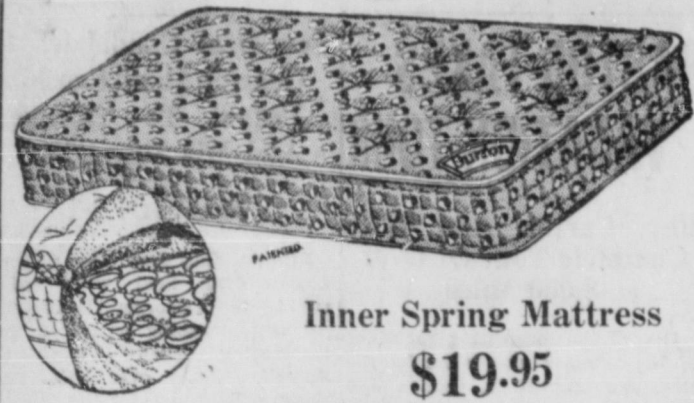
Inner Spring Mattress $19.95

Wanted—Experienced automobile mechanic. Auto Electric Garage, Decatur. 212 6t