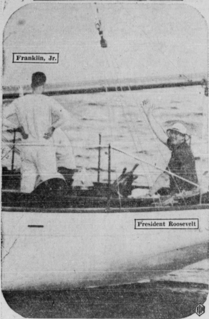
Responsibilities of office and campaign cares were set aside by President Roosevelt as he cruised up the New England coast at the tiller of the schooner-yacht Sewanna, above, accompanied by his three sons, Franklin, Jr., standing midships, John and James. The cruise will wind up at the Roosevelt summer home at Campobello Island, N. B., on July 28.