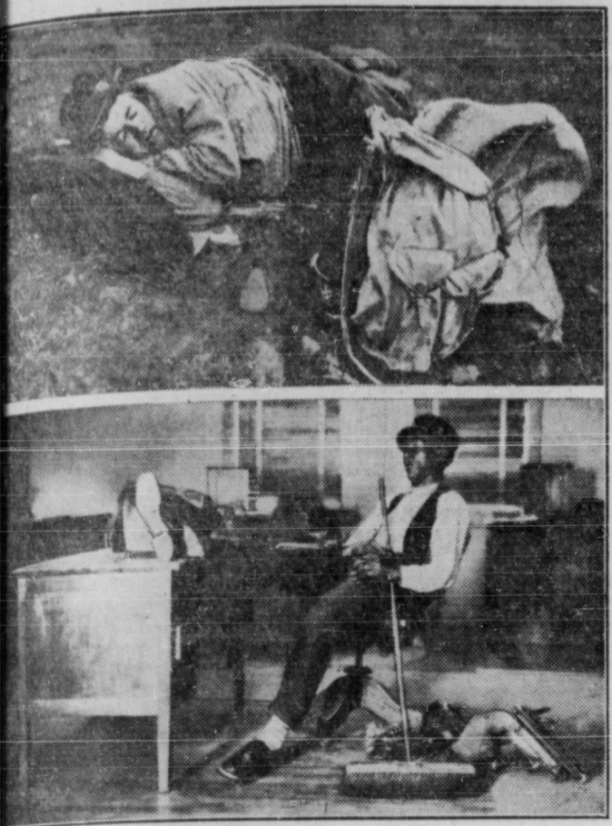
Many amateurs make hobbies of finding subjects with which to typify a single idea, phase of life or activity. Here are two pictures from an amusing collection picturing "Innocuous Desuetude."

WEALTHY art collectors often indulge their fancy by specializing in one kind of picture subject, such as landscapes, marine views, genre sketches or portraits, and assembling the pictures in a separate exhibit. As an amateur photographer you do not have to be wealthy to enjoy a similar hobby. With your camera you, too, can make a specialty of one kind of subject and derive even more pleasure than does the art collector, because you have made the pictures yourself. Choices for a one-subject photographic collection are endless. There are all sorts of appealing individual objects, types of which may be selected; there are the different activities and phases of life, the various phenomena of nature, and the characteristics of human nature, all of which may be portrayed in interesting pictures, if you will cultivate a discerning eye for them, and have your camera with you when you go places. We know a clever amateur who chooses as his subject WIND—big winds, hurricanes, cyclones, blizzards, breezes and zephyrs. He was so enthusiastic that he would hardly take his camera out if the wind were not blowing. His pictures consist of things in movement under the impetus of wind, or the results thereof—trees bending under the force of a storm, pretty girls with