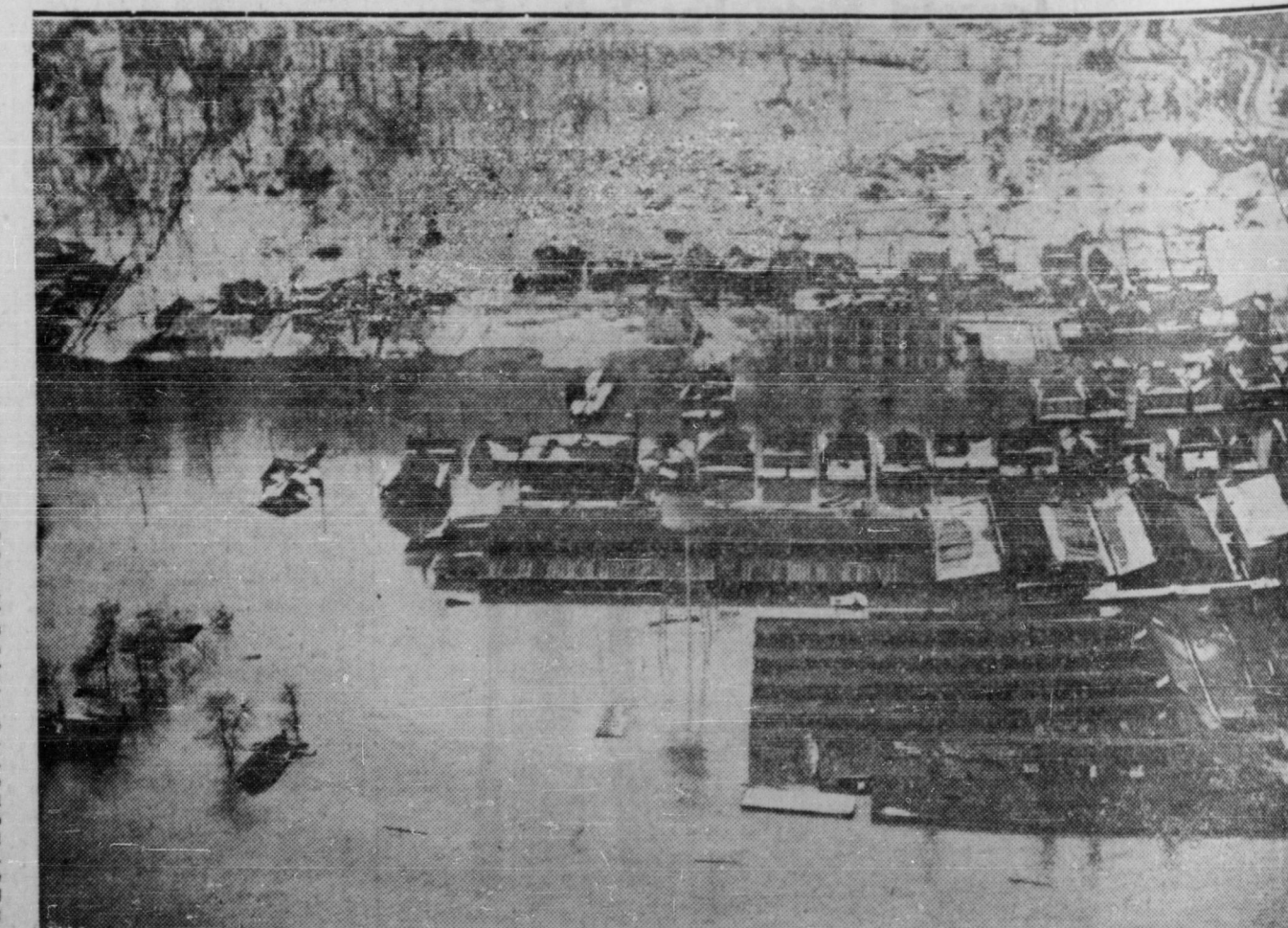
One of the hardest hit cities in the district flooded by the Ohio river was Bellaire, Ohio, immediately across the river from Wheeling, Va., a section where more than 20,000 were left homeless and at least 20 lost their lives. In the foreground is an enamel factory where workers had to flee for their lives when the flood waters swept the city.