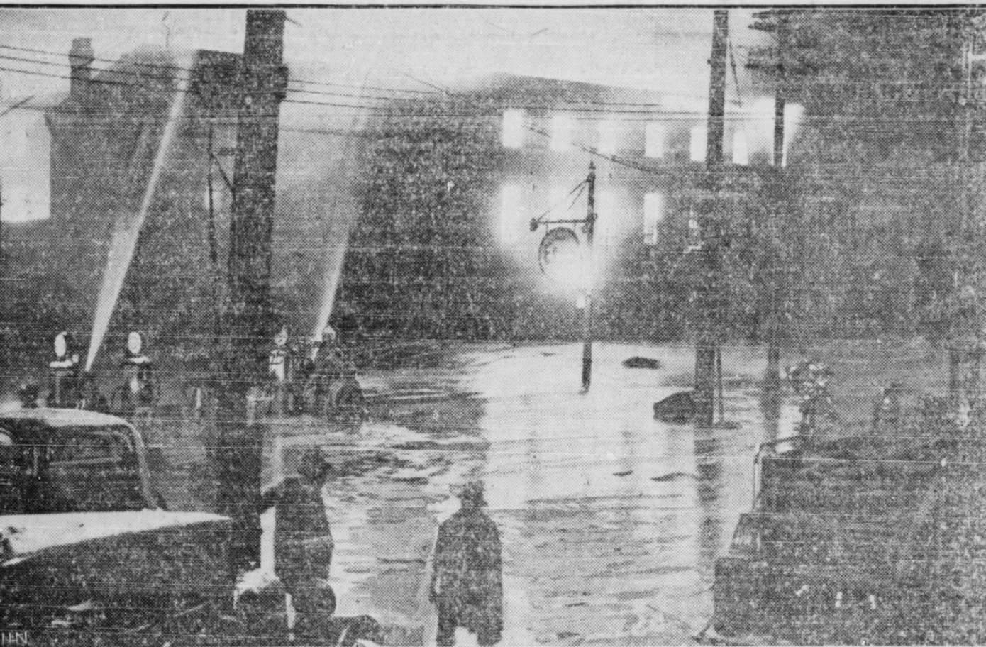
Fire and flood combined to wreck havoc with this Pittsburgh building which was destroyed by flames, along with several adjoining buildings, after a terrific explosion set off a blaze which roared through the block while flood waters 10 feet deep swirled through the street.