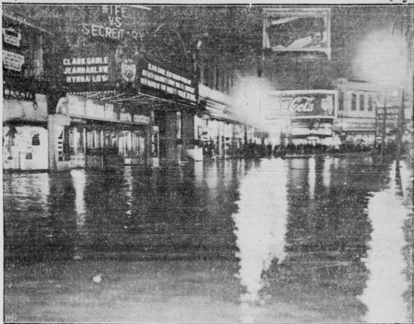
Pittsburgh's largest theater was flooded when three rivers which converge in the steel city overflowed their banks, inundating principal streets of the city.