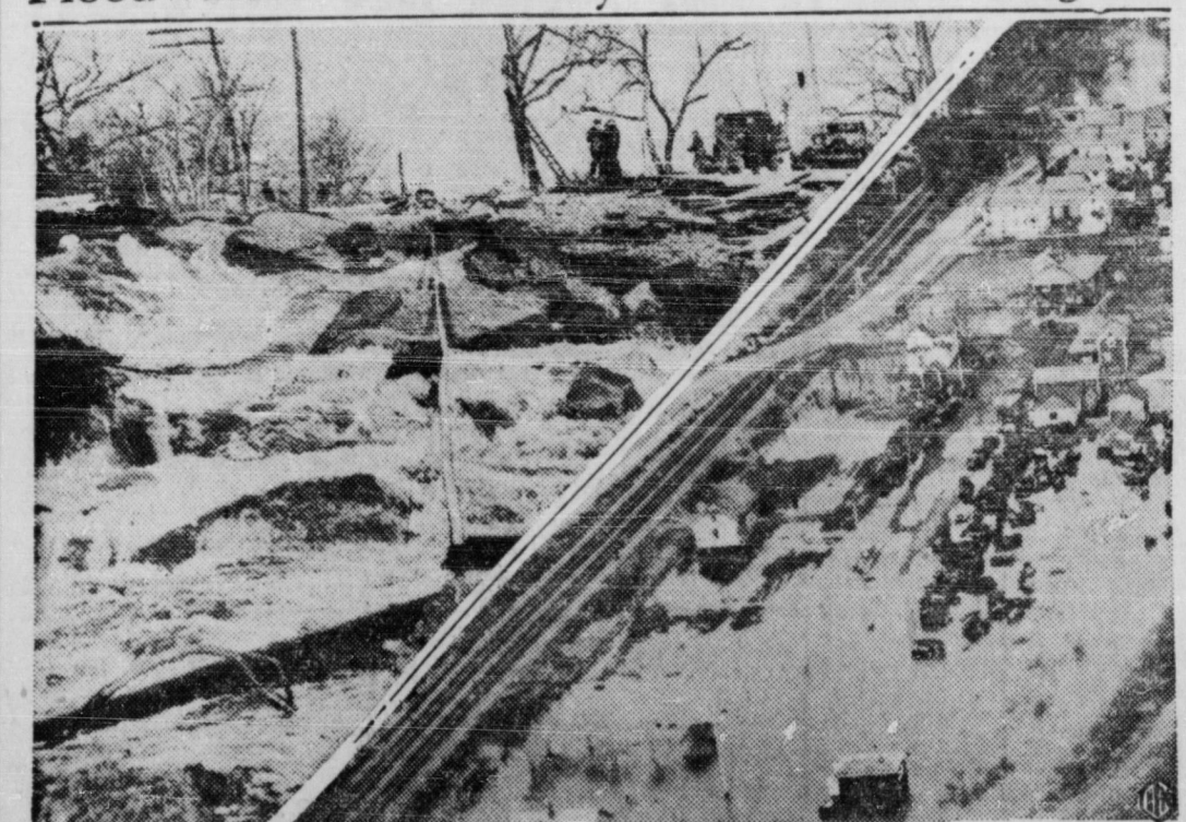
Highway washed out. New England is recounting the costs of the worst floods in years which inundated many sections, washing out highways such as the one at the upper left at West Upton, Mass., near Boston, and completely marooning scores of towns, among them Northbridge, Mass., lower right.