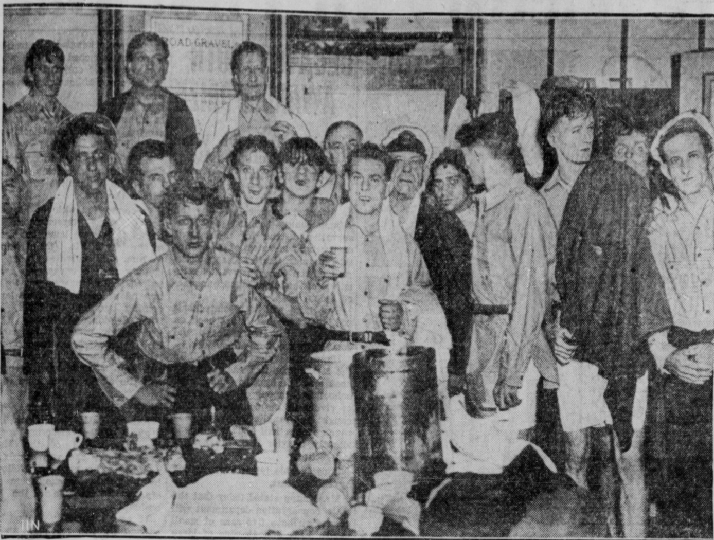
Here you see some of the half-clad survivors of the tragedy that befell the liner Morro Castle which caught fire off the coast of New Jersey. These passengers and members of the crew were brought to shore and safety at Spring Lake, N. J., in lifeboats.