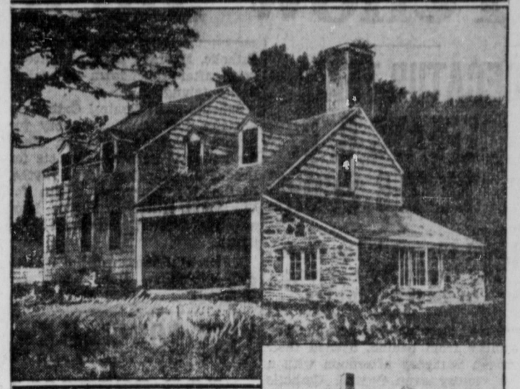
The improvement made on a farm house by modernizing is graphically shown in the illustrations. Above is the home as it appeared after the work was completed, while below is the place as it appeared at the outset.