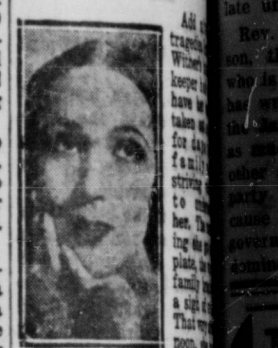
Dolores Del Rio