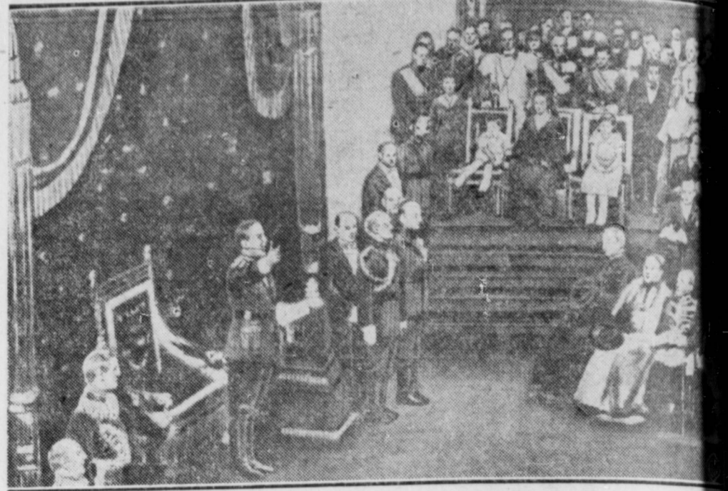
"I swear to observe the Constitution and the laws of the Belgian people and to maintain the national independence and integrity of territory!" With hand upraised, King Leopold III takes the oath that makes him King of the Belgians while Brussels rang with cries of "Vive le Roi." At right, surrounded by royal and church dignitaries are Queen Astrid and their children. This picture was sent to New York by wire.