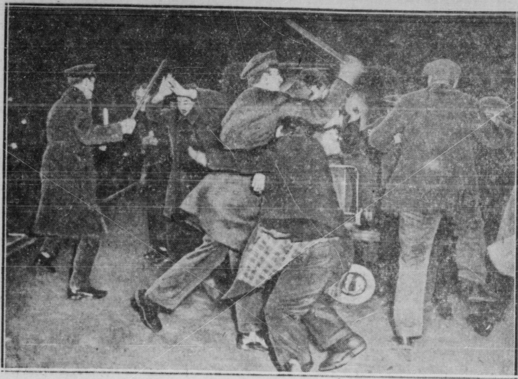
Swinging their nightsticks, policemen are shown Vice-President-elect John Garner and other Congresswading into a mob of 2,000 communists who staged a riot outside the New York home of President-elect Franklin D. Roosevelt while he was in conference with