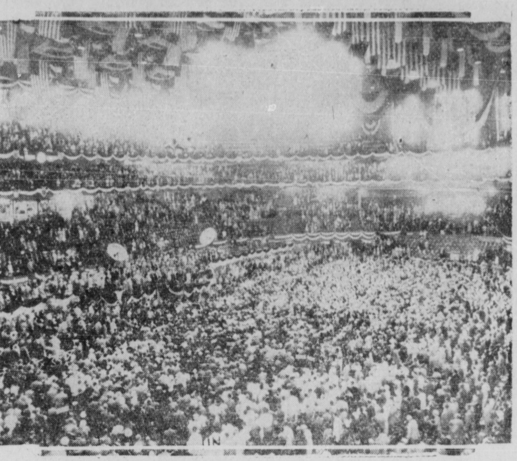
A general view as the Democratic national convention opened in Chicago Stadium.

a tarantula in a battle witnessed by Abel Sion of Kyle. After several vicious passes the wasp suddenly stung the large spider just behind the head, Sion said. The tarantula collapsed and was dragged away to the wasp's nest.