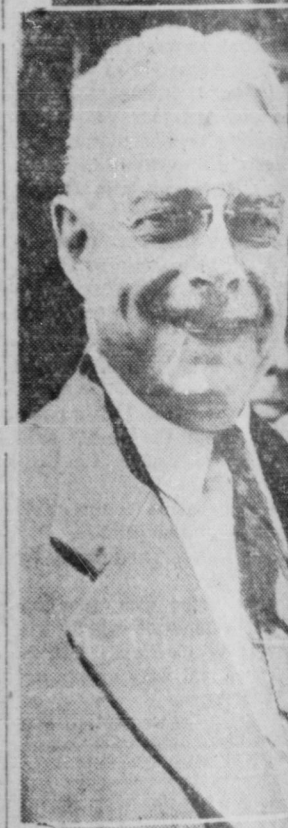
Governor Albert C. Ritchie, Maryland, a leading contender for the Democratic nomination, had this broad smile for the cameraman when he arrived in Chicago Friday.