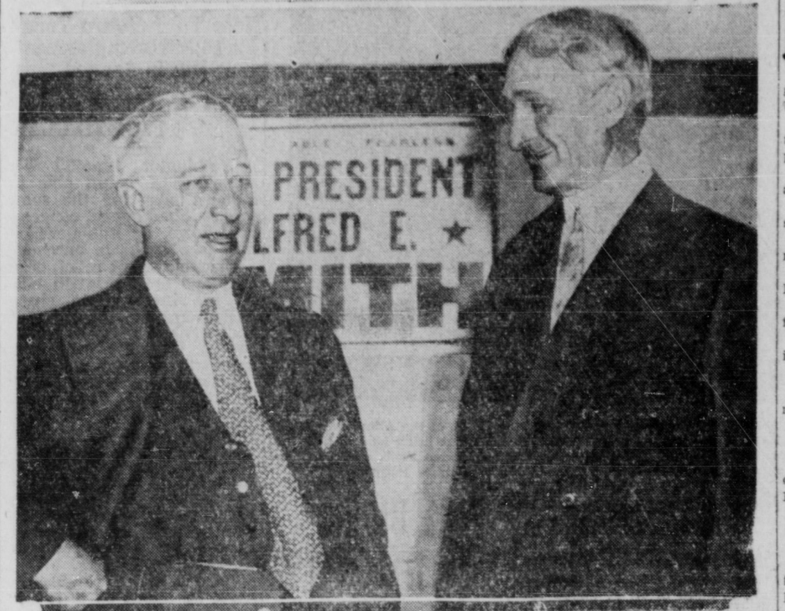
Alfred E. Smith, former governor of New York, and William G. McAdoo, who deadlocked the 1924 Democratic convention with their battle for the presidential nomination, shook hands Thursday when they met in Chicago. They are shown here at Smith headquarters in Chicago.