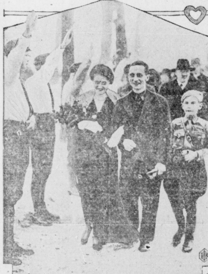
It is hard to imagine the doughty Adolf Hitler, leader of Germany's National Socialist (Nazis) Party, in the role of a follower of Cupid. But here he is shown aiding and abetting the little god with the bow and arrow. Photo was made on the occasion of the wedding of Dr. Goebbels, prominent in Hitler's Fascists, in a little village of Sverrin, Germany. The bride is the former Magda Quanti, and her little son is shown walking beside his new stepfather. Hitler is in rear with soft hat. Note the Fascists who lined the bridal route giving the familiar salute.