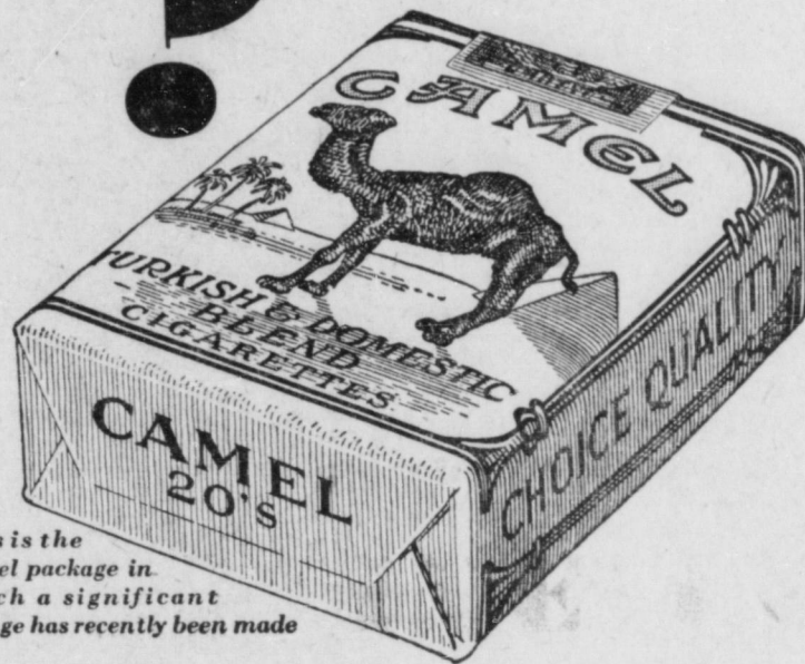
This is the Camel package in which a significant change has recently been made