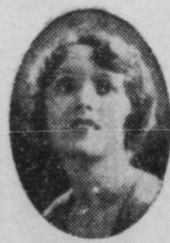
Mother's Friend lessens pain.

THOUSANDS of expectant mothers are now cheerful and happy. Their waiting months have been made comfortable and they will be better prepared when the great moment of childbirth arrives. This has also been true of countless thousands of expectant mothers for over 60 years who have used "Mother's Friend," that time-tested, scientifically-prepared skin lubricant and pain-reducer which originated in the prescription of an eminent obstetrician. You, too, may enjoy the comfort "Mother's Friend" gives. It is so soothing and relaxing! It is used externally only—gently rubbed into the skin. Brings relief promptly. Very valuable in keeping the breasts in good condition. Also puts you in fine shape for the approaching ordeal. "Mother's Friend" is on sale at all drug stores. $1.25 per bottle. Try a massage with it tonight and notice the ease and comfort it gives. A booklet on "Things to Know Before Baby Comes" will be mailed in plain envelope, free, on request. Address Bradfield Regulator Co., Dept. 12, Atlanta, Ga.