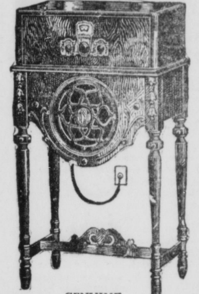
GENUINE SHOWERS CABINET

without tubes ready to attach to your antenna