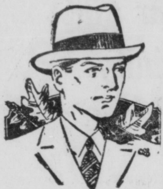
MEN'S NEW FALL DRESS HATS

Boy's Dress Caps 59c and 98c Men's Dress Caps, all new fall patterns 79c, 98c, $1.39, $1.48