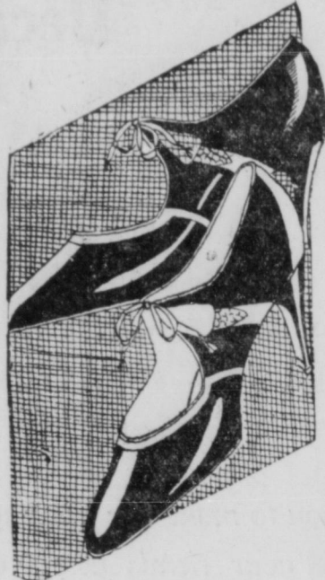
Star Brand Shoes are Better

High in quality, stunning in style—Straps, Pumps, Ties