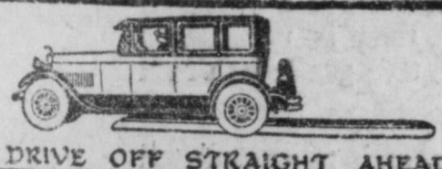
DRIVE OFF STRAIGHT AHEAD