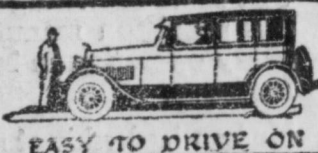
EASY TO DRIVE ON