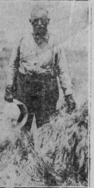
Charles Bryan, brother of the "Great Commoner" and Democratic choice for Vice President in 1924, prepares for his coming campaign for governor of Nebraska in the fields of his farm near Lincoln.