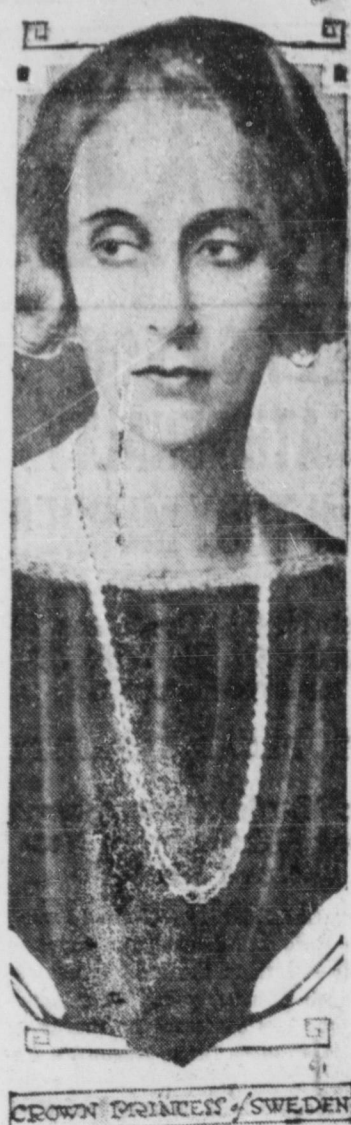
CROWN PRINCESS OF SWEDEN

The Crown Princess of Sweden has been invited to represent Sweden at the unveiling of the John Ericsson monument in Washington, May 29, and undoubtedly will attend with the Crown Prince.