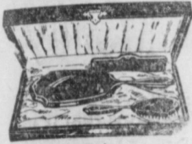
This 3-Piece Set